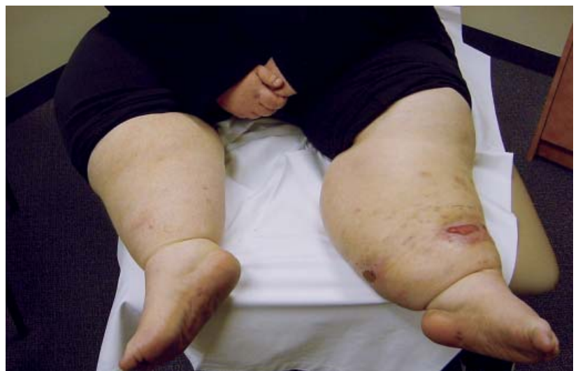
▲ figure 10 21 year-old man with Prader-Willi with wounds