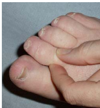
figure 1 Demonstration of positive Stemmer sign, the inability to pick up a fold of skin at the base of the second toe, indicates thickening of the skin and is useful in differentiating lymphoedema from other forms of oedema. Also known as Kaposi-Stemmer sign.