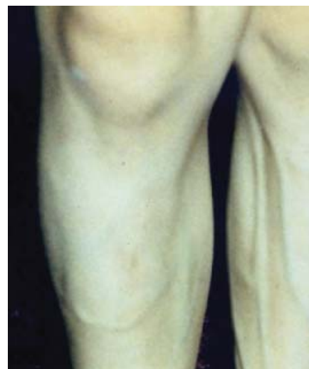
figure 3 Prominent veins, commonly seen in Milroy disease.