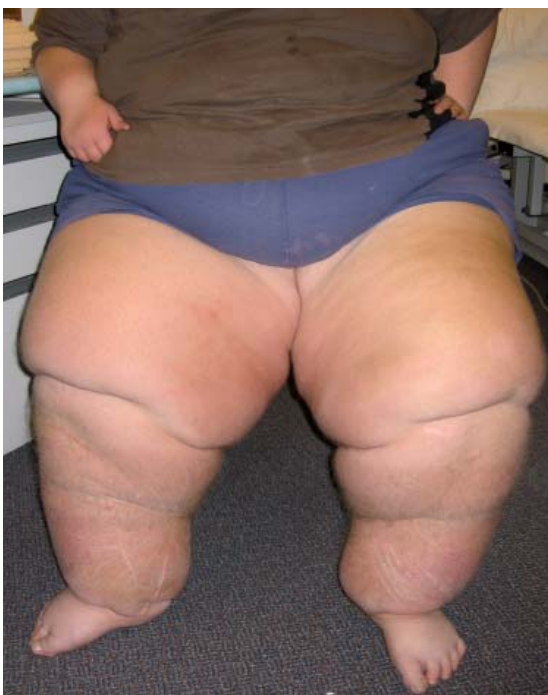
◀ figure 9 20 year-old man with Prader-Willi